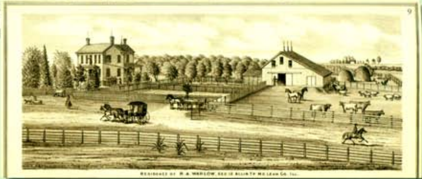
Lithograph — 1874

The McLean County Museum of History and the McLean County Genealogical Society are proud to announce the publication of one of our most ambitious projects in our 100 year history.